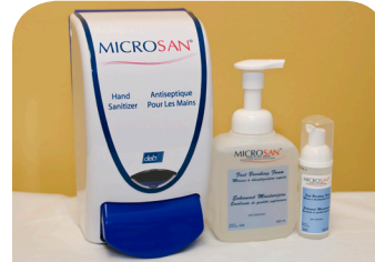
1. Sanitizer options

Cleaning hands is the most important way to Stop the Spread of germs that cause infection. Patients and visitors need clean hands too!