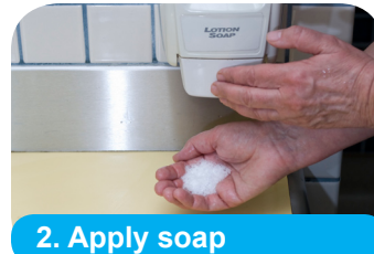
2. Apply soap