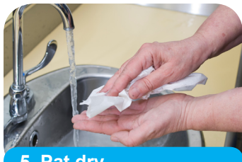
5. Pat dry