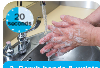
3. Scrub hands & wrists

3. Lather hands for about 20 seconds while rubbing with soap.