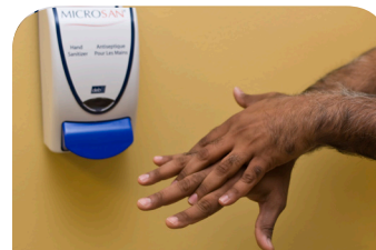
4. Back of hands