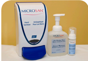
1. Sanitizer options

Cleaning hands is the most important way to Stop the Spread of germs that cause infection. Patients and visitors need clean hands too!