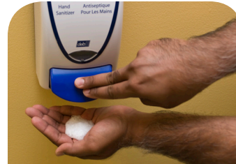
2. Apply alcohol-based sanitizer