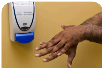
4. Back of hands