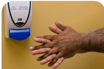
3. Rub into hands and fingers