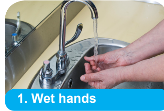
1. Wet hands

Patients and visitors can Stop the Spread by cleaning their hands.