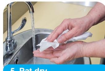
5. Pat dry