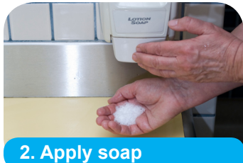
2. Apply soap