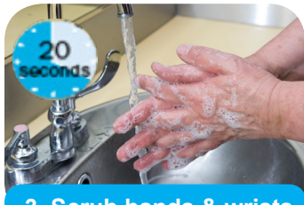
3. Scrub hands & wrists

3. Lather hands for about 20 seconds while rubbing with soap.