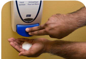
2. Apply alcohol-based sanitizer