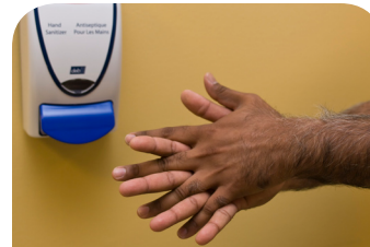
3. Rub into hands and fingers