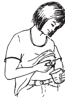
Push back against chest wall

Hand expressing your milk takes time to learn. You will become successful. Massaging your breast, using moist heat or cuddling your baby skin-to-skin before you hand express will help. Before starting, get comfortable and take a moment to relax.