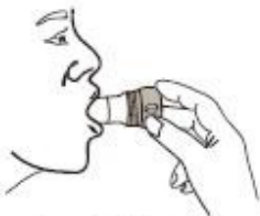
Figure 3 – Inhalation